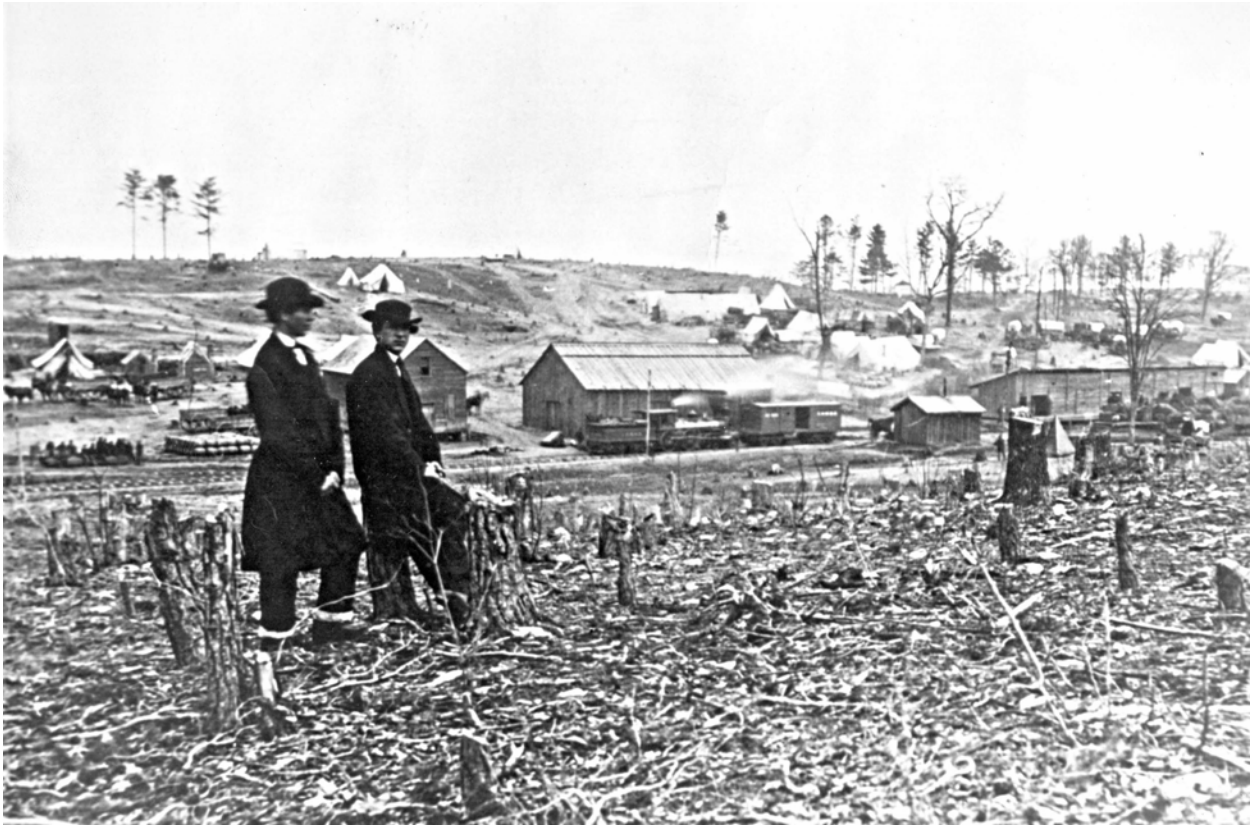
Fairfax Station, 1862. Camps of troops in and around Fairfax and Fairfax Station picked the land clean of firewood, as the numerous stumps visible in this image illustrate. Plans to supplement the Orange & Alexandria Railroad, seen here, with a line of the Manassas Gap Railroad through Fairfax were ended by the coming of the war.

measures to combat bands of marauders who were preying on the farms and plantations in the countryside.