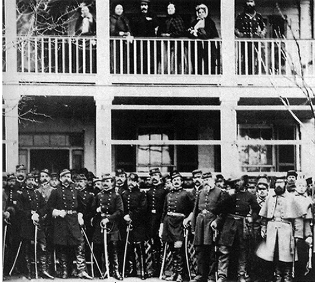
Officers of the 8 th New York Infantry in front of the Willcoxon Tavern, 1861.

Some sites, including the present City Hall property and the Willcoxon Tavern, were known or could be expected to have been the focus of multiple types of military occupations by both sides throughout the war. This can make teasing apart the cumulative archaeological remains of such multiple, overlapping occupations by both Union and Confederate troops difficult, to say the least. And even if evidence of Union or Confederate presence can be confirmed, the archaeologists need to be aware that multiple types of sites may be represented by similar artifacts, particularly if the evidence is limited to what could be documented or recovered during only a brief reconnaissance survey. Research by C.K. Gailey, Patricia Gallagher, and