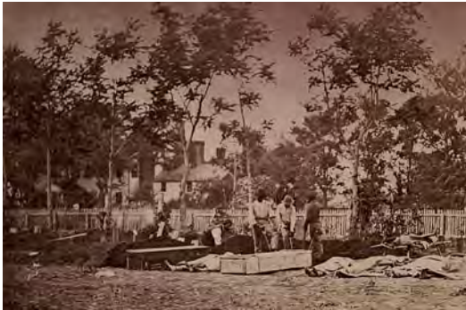
Burying dead Union soldiers outside a hospital in Fredericksburg, Virginia. Soldiers whose families or friends could afford it were shipped home, while others were buried and stayed in Fairfax until being moved to Arlington National Cemetery just after the war. Library of Congress

During the war, Union dead were interred in a number of places, including both private property and church grounds. Since not all are associated with places known to be hospitals, they could have been interment sites for dead from the battles of 2 nd Manassas or Ox Hill. The other