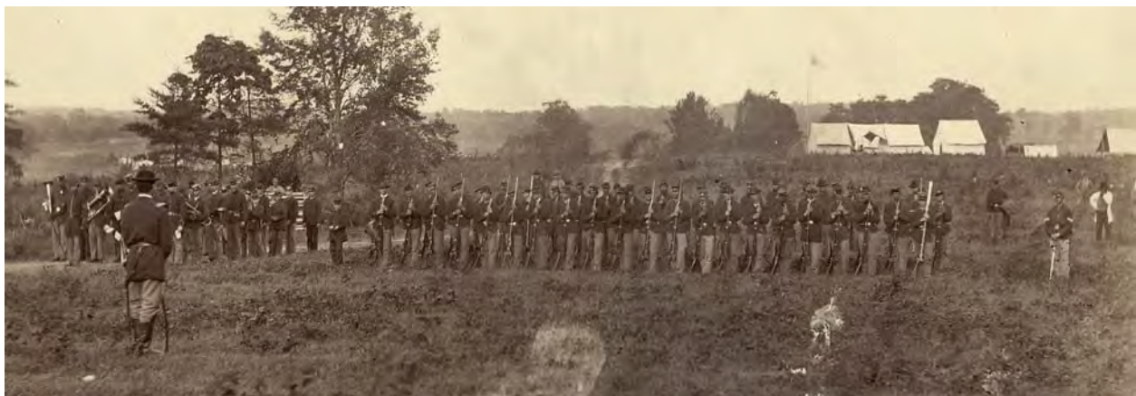
8 th U.S. Infantry, Fairfax Court House, June 1863. Fairfax spent most of the war after mid-1862 under Union control.

For the remainder of the war, Fairfax was under Union control, serving as the headquarters of the Artillery Reserve for the Army of the Potomac, Signal Corps, and Quartermaster's Office at different times. The VI Corps camped at Germantown, which was