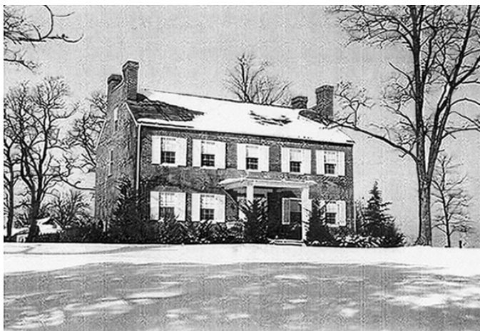
Blenheim, home of the Willcoxon Family, in 1948. It was apparently used by soldiers as a refuge.

Before the war, the Fairfax region experienced the agricultural depression felt by much of Virginia. Economically focused on growing tobacco using enslaved laborers, colonial and early nineteenth-century Virginians found that the crops drained the nutrients from the soil and made the land unproductive. This lowered land values and brought farmers from the north into Fairfax, who experimented with a number of new fertilizing methods to restore productivity. In spite of this migration of people from Northern states, Fairfax was, in 1860, generally sympathetic to the concerns of the Deep South over the threat to the