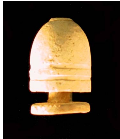
Williams Type III Bullet Recovered in Fairfax