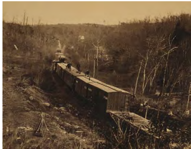
Orange & Alexandria Railroad in operation near Union Mills, Virginia, during the war.

Nineteenth-century field fortifications, in general, were temporary works usually employed to fortify points of strategic importance to an army's operations at that time. Probably the most important function of a field fortification was to strengthen tactical positions and to provide the means for an inferior army to withstand and repel an attack by a stronger, more numerous enemy force. They also provided security for an army's lines of communications and protection of its base of operations, as well as other strategic or tactical points not covered by more permanent fortifications. By tradition, field fortifications were generally classified and described by the shape formed by the lines and angles of the parapet. One of the earthwork sites situated within the City was labeled on period maps as the "Star Fort." A star fort would be a field fortification that got its name from the general resemblance of its shape to the conventional symbol for a star. Unfortunately, the available documentary evidence does not indicate when the fort was constructed and what forces occupied the fort. A report from a Fairfax property owner to the Southern Claims Commission after the war does indicate, however, that Sigel's XI Corps fortified Fairfax Court House during the autumn of 1862, so it's possible that they were responsible for construction and occupation of the star fort.