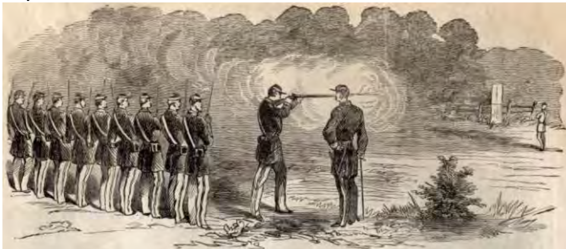
Union troops taking target practice. Harper's Weekly, June 21, 1861