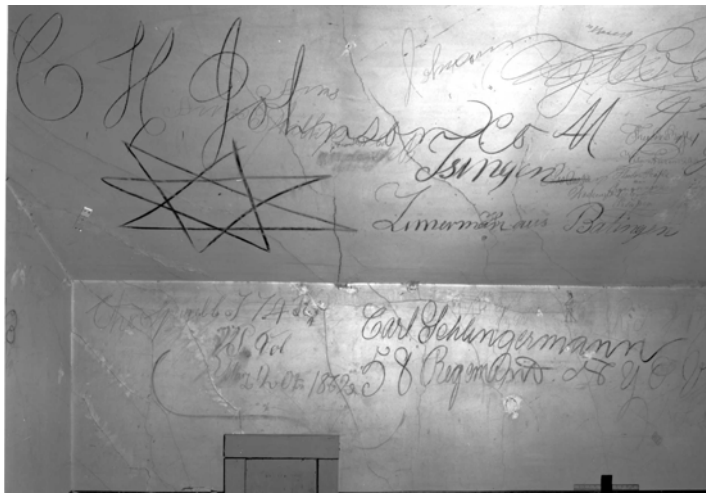
Graffiti in attic of Blenheim.