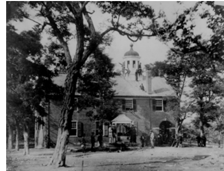
Fairfax Courthouse during the Civil War.

In recent decades, the expansion of the suburbs surrounding Washington, D.C. has sparked the development of much of the land in and around the City of Fairfax. This land development poses a continuing threat to the physical traces of Fairfax’s past, including the archaeological remains associated with families, travelers, and soldiers who lived, visited, and/or occupied Fairfax during the Civil War. Given redevelopment planning needs and the City’s goals of making informed planning decisions that consider significant resources, the City and the Virginia Department of Historic Resources co-sponsored a survey of Civil War resources in the City in 2005 by researchers from the William and Mary Center for Archaeological Research. This booklet summarizes the results and offers examples of what archaeology can tell us about the ways soldiers and civilians in Fairfax experienced the Civil War.