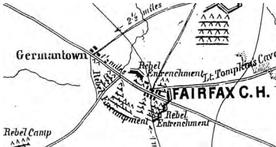
Camps in and around Fairfax. Note the gap on the south side of the Little River Turnpike, possibly caused by the Manassas Gap Rail Road embankment and its use as a defensive earthwork.