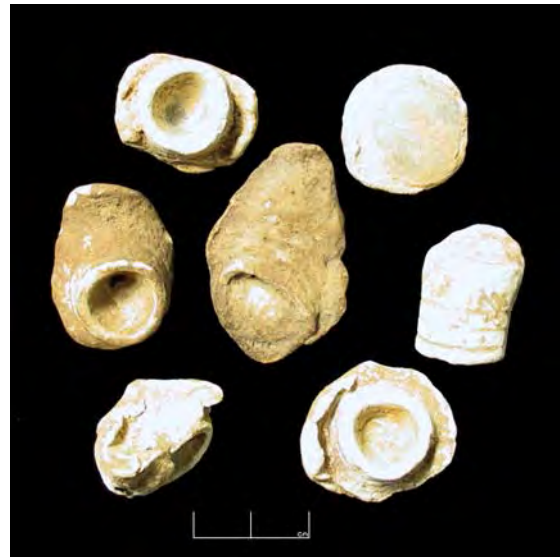
Scatter of fired bullets recovered from an embankment within the City of Fairfax during the survey. Possibly from a guard tent or firing range, such groupings of artifacts give us windows into the minutiae of life in Civil War armies.

This cluster of bullets could also mark the presence of a guard tent. Screening every encampment from surprise and attack were a series of pickets, guards to keep away the enemy and to control the movement of people out of and into the camp. Guard duty was a shared responsibility of the entire regiment, with men taking turns serving shifts that lasted several hours. When on guard, weapons had to be kept loaded. When coming back from guard, the soldiers had to unload their weapons so they did not accidentally go off in camp, wounding or killing a fellow soldier. This also made the weapon ready to be cleaned in preparation for inspection. When guards came off picket duty, they would stop at the guard tent to report on any suspicious activities and ensure that their weapons were not loaded. It was common for them to do so by firing them into some sort of embankment. It is possible that the scatter of bullets recovered from an embankment during the survey represents just a group of guards coming in from the front lines, headed back to camp. It is a brief moment in the daily routine of the common soldier.