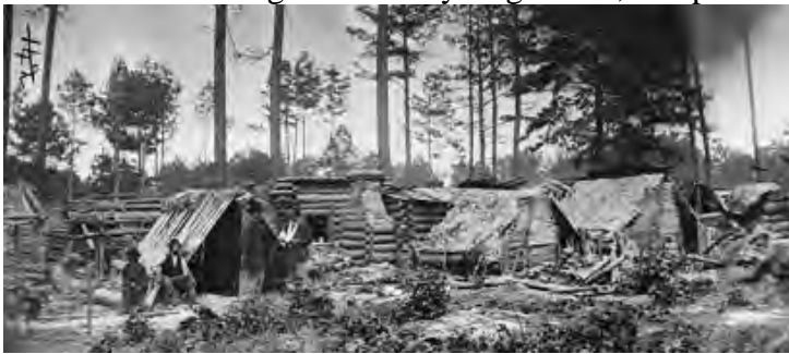
Confederate camp, Petersburg, Virginia. Cramped conditions in Civil War camps, combined with a lack of adequate medical care and sanitation resulted in disease being the biggest killer of the war. At least a dozen Confederate soldiers died in Fairfax during the first summer of the war.